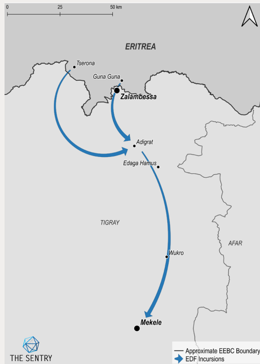
Path of the Eritrean Defence Forces' looting spree from Zalambessa to Mekele in November and December 2020.

Having secured control of Zalambessa, most of the force deployed south. Upon reaching Adigrat, both EDF and ENDF troops looted and then destroyed the town's major institutions—museums, the university, the hospital, and the Addis Pharmaceutical Company Factory, Ethiopia's largest producer of generic medicines including amoxicillin and paracetamol. 135, 136, 137, 138, 139 In May 2021, Médecins Sans Frontières reported that approximately 20 ambulances from Adigrat and the surrounding area had been seized by "armed groups," adding that staff subsequently saw "some of these vehicles being used by soldiers near the Eritrean border, to transport goods." 140 A month later, the Eritrean opposition and London-based Asena TV reported that vehicles stolen from the hospital were distributed to Eritrean ministries. 141