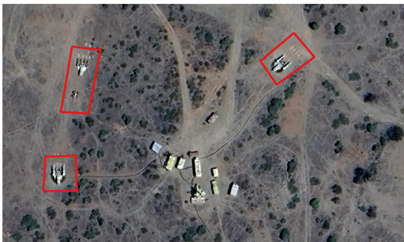
Satellite image of what appear to be newly installed S-125 quadruple launchers and a P-18 early warning radar near Salai Dairo, approximately 14 km south of Asmara, May 2024.

Unlike every other actor involved in the turbulence of the region over the past five or so years, and despite the loss of countless Eritrean soldiers in the conflict, the EDF has emerged stronger rather than weaker. The rebuilding of Eritrea’s armed forces has continued since the signing of the Pretoria Agreement. Investments appear to have been made in solidifying Eritrea’s new interpretation of the border, avenging what is perceived as Ethiopia’s annexation of its sovereign land by over-correcting and occupying parts of Tigray. 290, 291, 292 While Ethiopia’s northern border defenses have been looted or destroyed, satellite imagery clearly shows the significant fortification of Eritrea’s southern borderlands over the past few years. 293