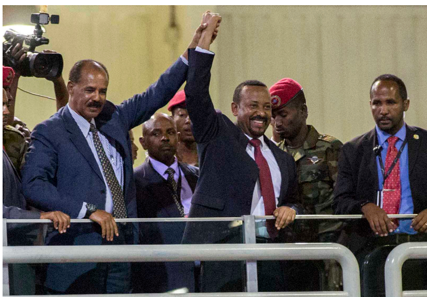
Eritrean President Isaias Afwerki and Ethiopian Prime Minister Abiy Ahmed, center, raise arms together in celebration before a crowd in Addis Ababa, Ethiopia, July 15, 2018.