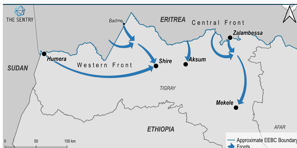
Entry points and initial offensive paths of the Eritrean Defence Forces into Tigray in November and December 2020.