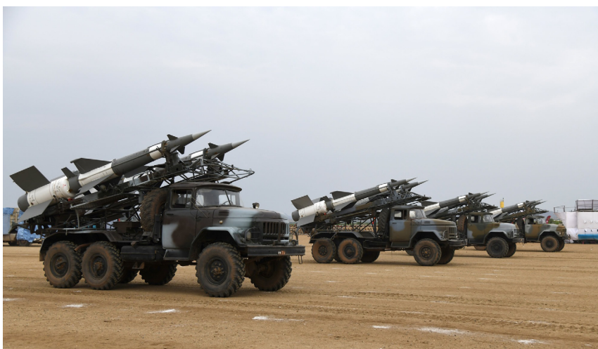
Newly acquired Russian-manufactured S-125 Neva/Pechora surface-to-air missiles on parade at the Sawa military training center, August 2019.

alongside their counterparts in both Addis Ababa and the administration of the Amhara region, 42, 43 and Abiy began promoting officers from other ethnic groups to reduce the influence of Tigrayans within the Ethiopian National Defense Force (ENDF) leadership. 44