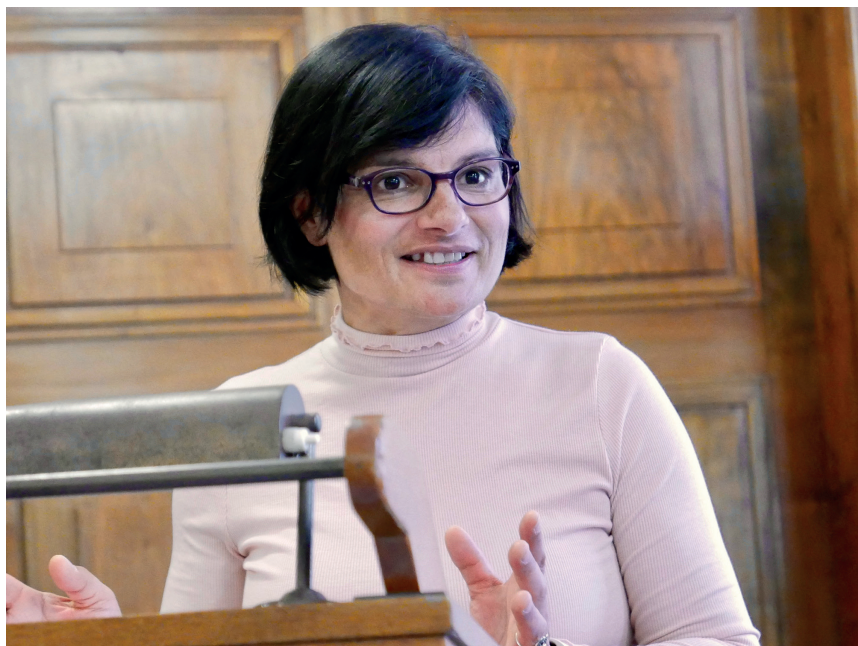
Thangam Debbonaire MP, Member of Parliament for Bristol West and Co-Chair of the Eritrea All-Party Parliamentary Group

Thangam Debbonaire introduced herself as the Co-Chair of the All-Party Parliamentary Group (APPG) on Eritrea and Chair of the APPG on Refugees.