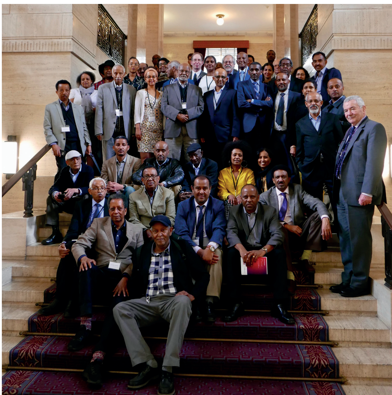
Group photo of delegates at the conference