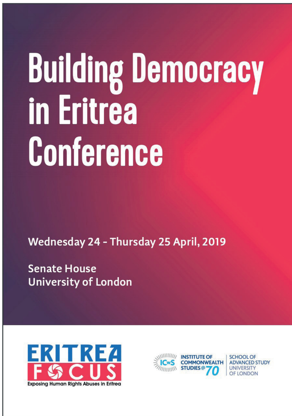
Front cover of the conference brochure; available to view here